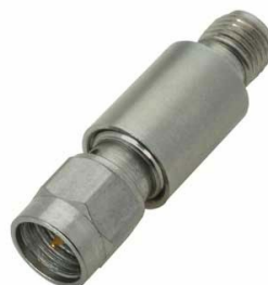
Model Number: EQ1103-XX SMA Connectors