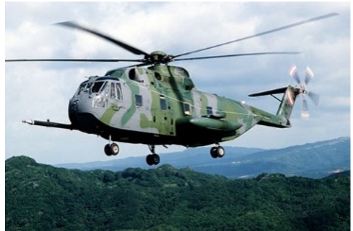
Helicopter pilots also rely on electronics for classified communications

Spectrum Control offers rugged parts built with a die cast shell and have solder construction for service in harsh environments with vibration. These connectors help improve performance and safe operation, save board space, and reduce costs by managing EMI at the signal and power I/O.