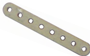
Planar Array Capacitor