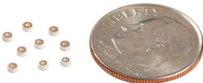
Single Line Discoidal Capacitor

High-reliability EMI filtering components keep ICDs functioning properly.